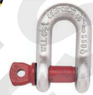
G-210 / S-210

G-210 Screw pin chain shackles meet the performance requirements of Federal Specification RR-C-271E, Type IVB, Grade A, Class 2, except for those provisions required of the contractor. For additional information, see page 444.