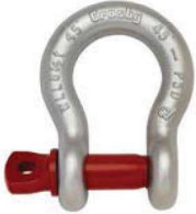
G-209 / S-209

G-209 Screw pin anchor shackles meet the performance requirements of Federal Specification RR-C-271F Type IVA, Grade A, Class 2, except for those provisions required of the contractor. For additional information, see page 444.